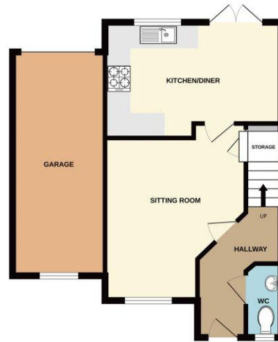
GROUND FLOOR 536 sq.ft. (49.8 sq.m.) approx.