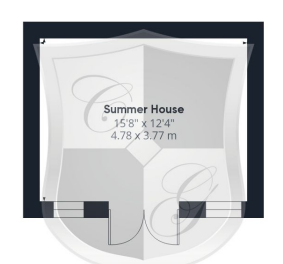
Floor 1 Building 2