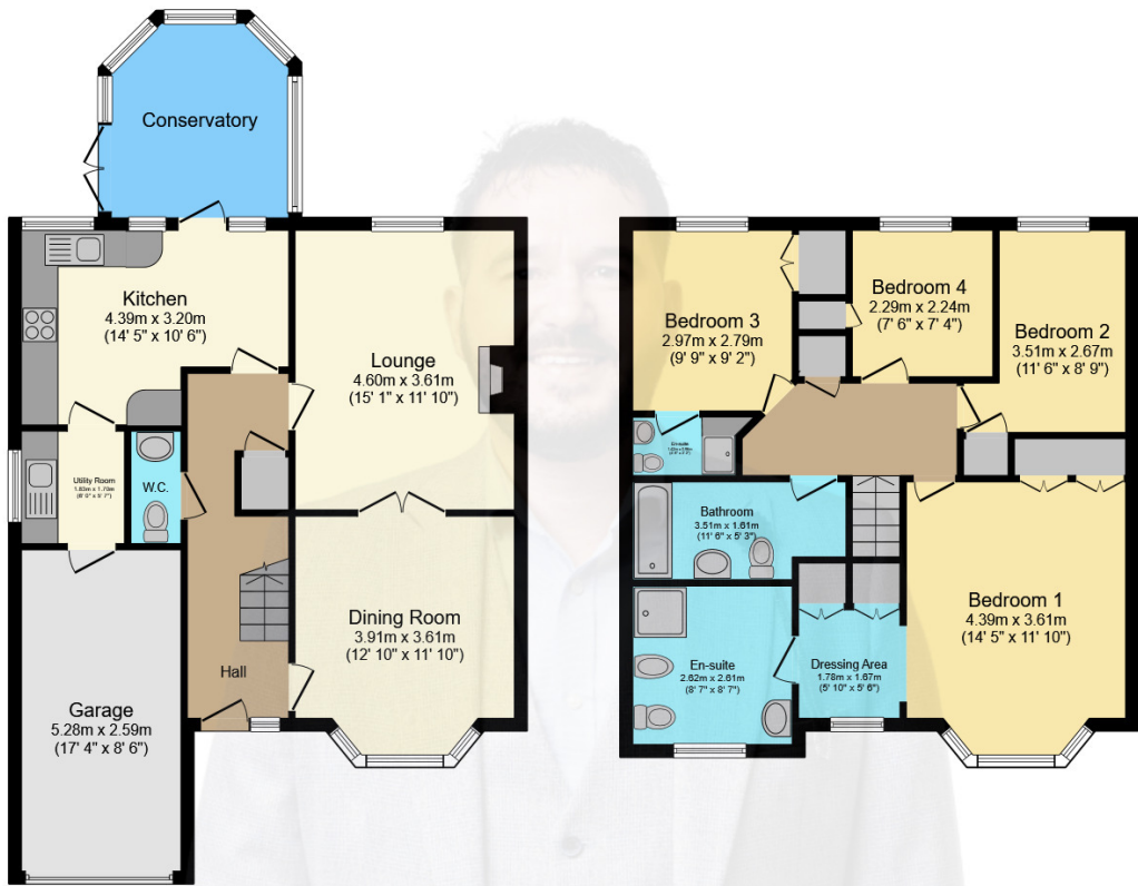
Ground Floor Floor area 82.0 sq.m. (883 sq.ft.)

Close to all local amenities, schools, parks and transport links including the train station.