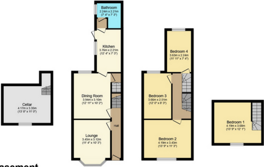
Basement Floor area 14.5 sq.m. (156 sq.ft.) approx

The property is close to all local amenities, schools, parks and within easy walking distance of the main shopping Parade.