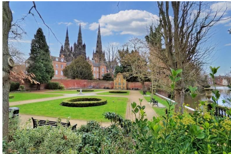
Nearby memorial gardens