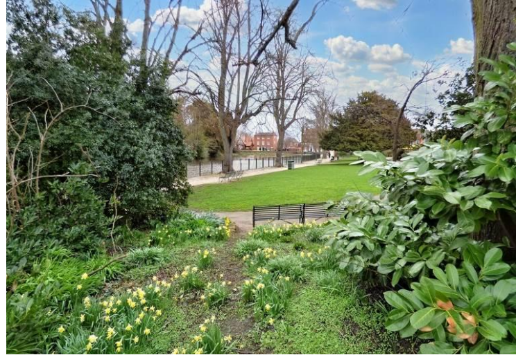
Nearby Minster Pool