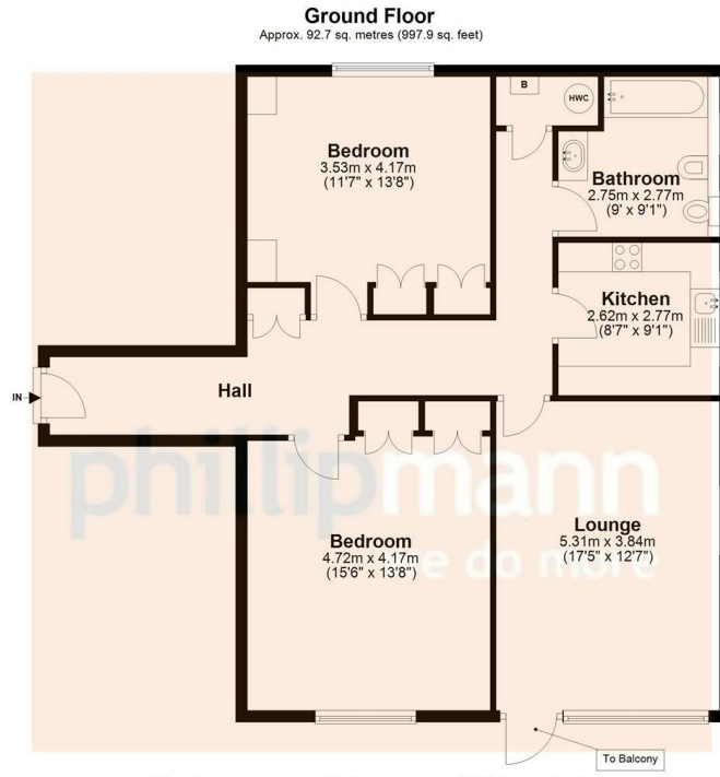
Total area: approx. 92.7 sq. metres (997.9 sq. feet) This floor plan is for illustrative purposes only. All measurements are approximate.