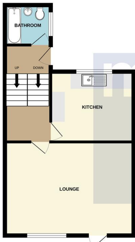
GROUND FLOOR 463 sq.ft. (43.0 sq.m.) approx.