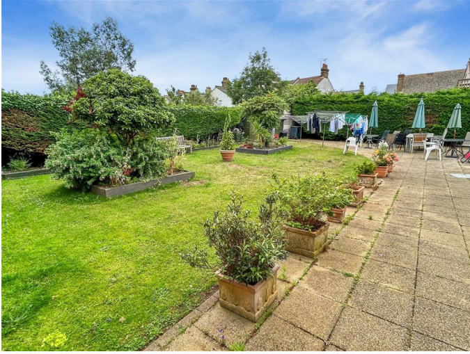
Attractive communal garden, communal resident parking.