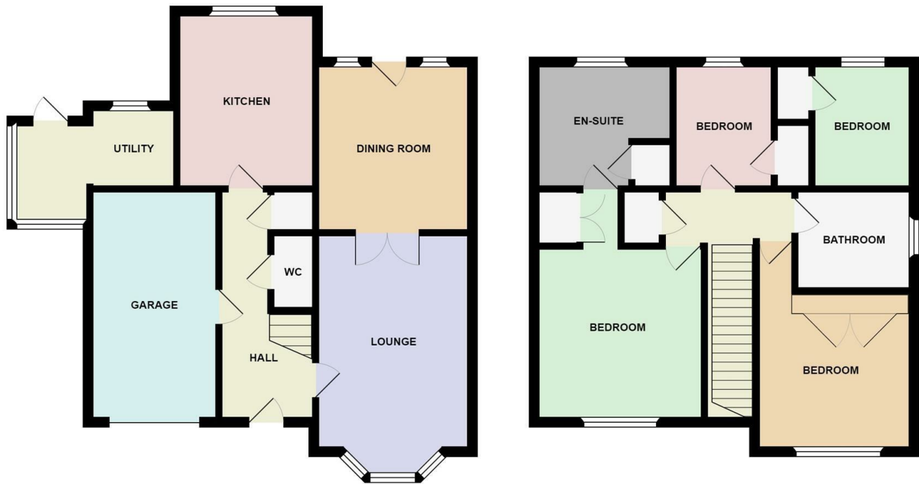
23 Four Sisters Way Leigh SS9 5FQ