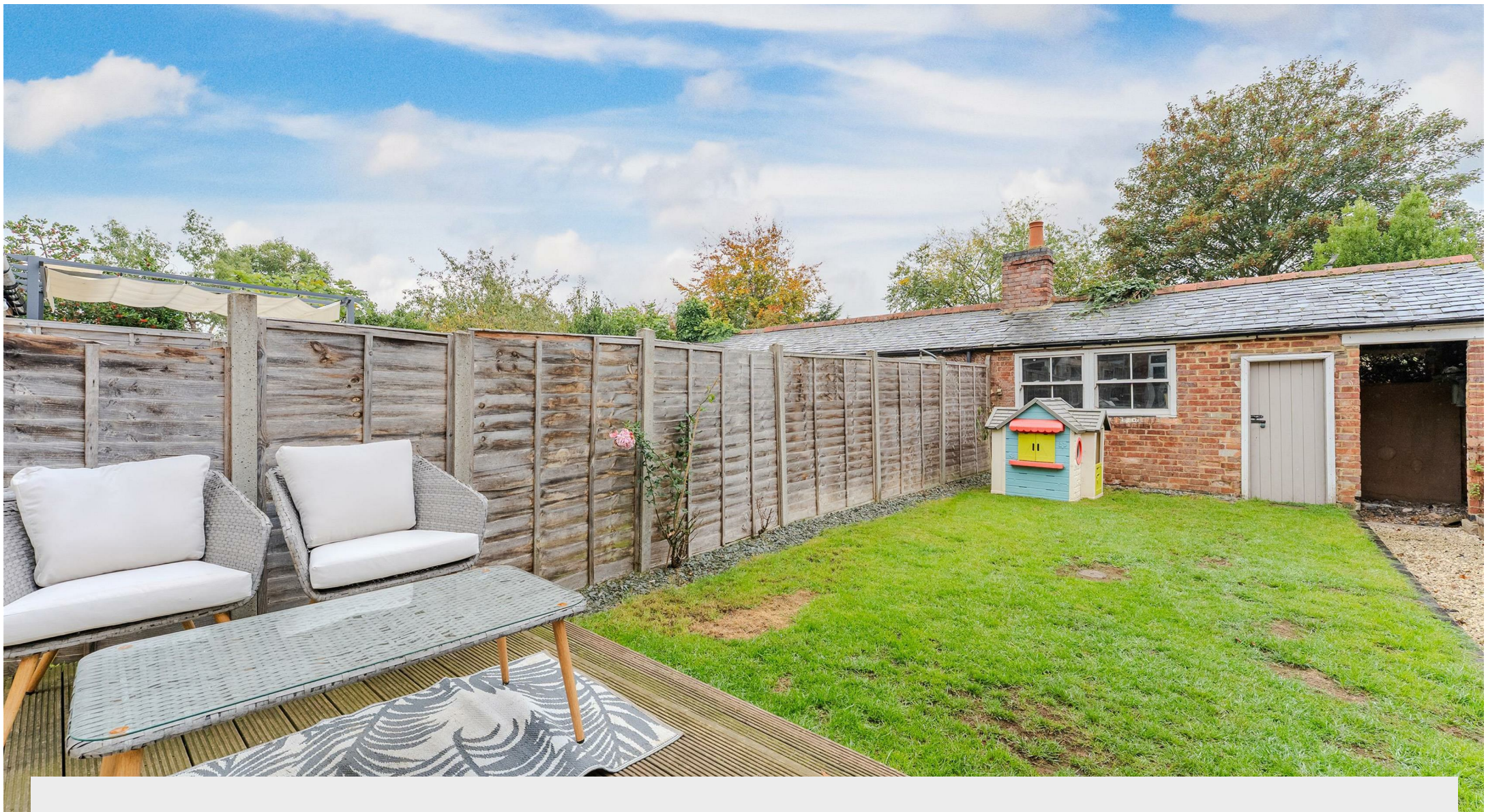
Westerly Facing Rear Garden.