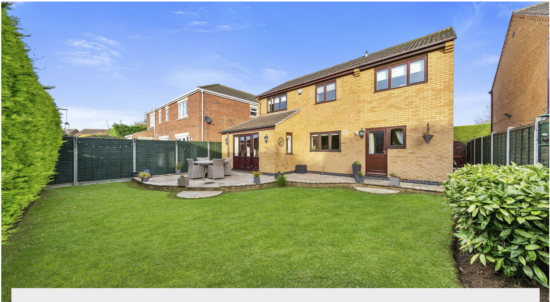
Enclosed Rear Garden.