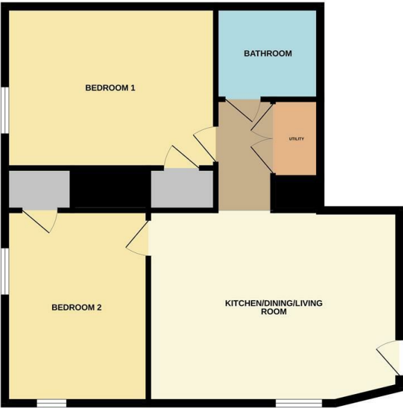
TOTAL FLOOR AREA : 685sq ft. (63.6 sq.m.) approx. While every attempt has been made to ensure the accuracy of the floor plan contained here, measurements of floor, window, doors and any other items are approximate and no responsibility is taken for any error, omission, or misstatement. The plan is copyright to Simpson and Partners and is for illustrative purposes and should only be used as such by any prospective purchaser. The services, systems and appliances shown have not been tested and no guarantee as to their operability can be given. Made with Metagor (2020)