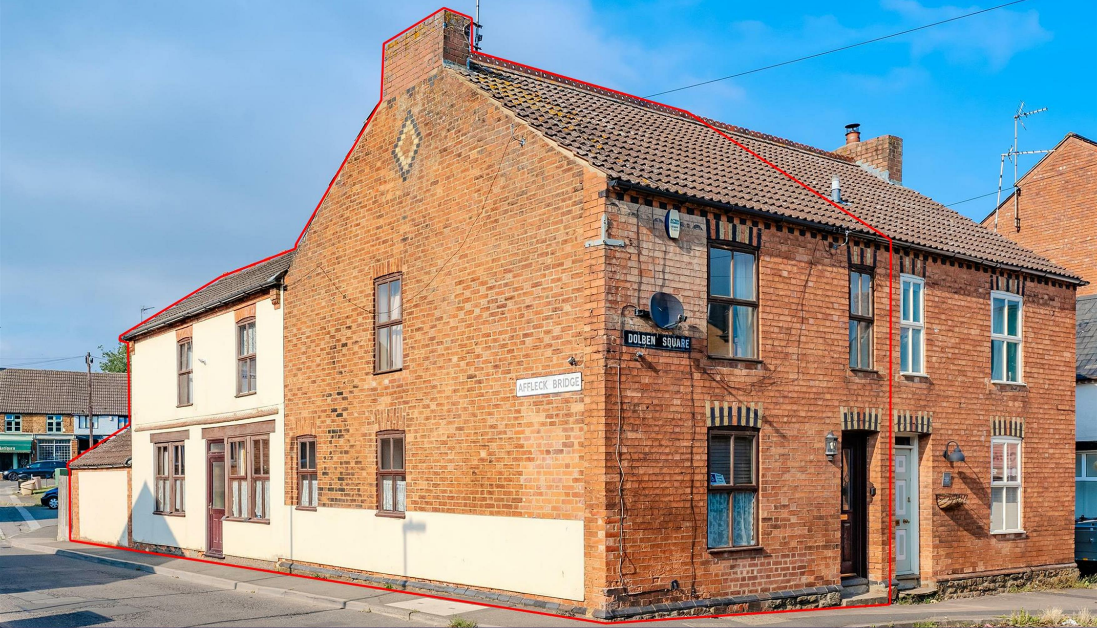
1. Dolben Square Finedon, NN9 5LY