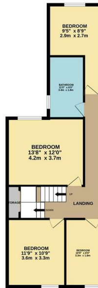
2ND FLOOR 615 sq.ft. (57.2 sq.m.) approx.