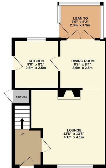
GROUND FLOOR 404 sq.ft. (37.6 sq.m.) approx.