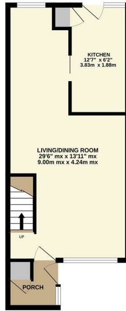
GROUND FLOOR 442 sq.ft. (41.1 sq.m.) approx.