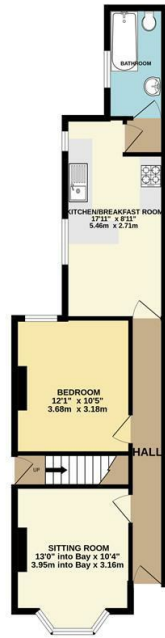
GROUND FLOOR MASONETTE