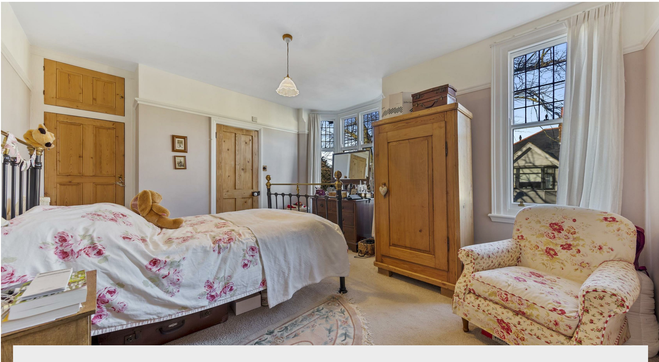
Bay Fronted Bedroom With En-Suite Shower Room.