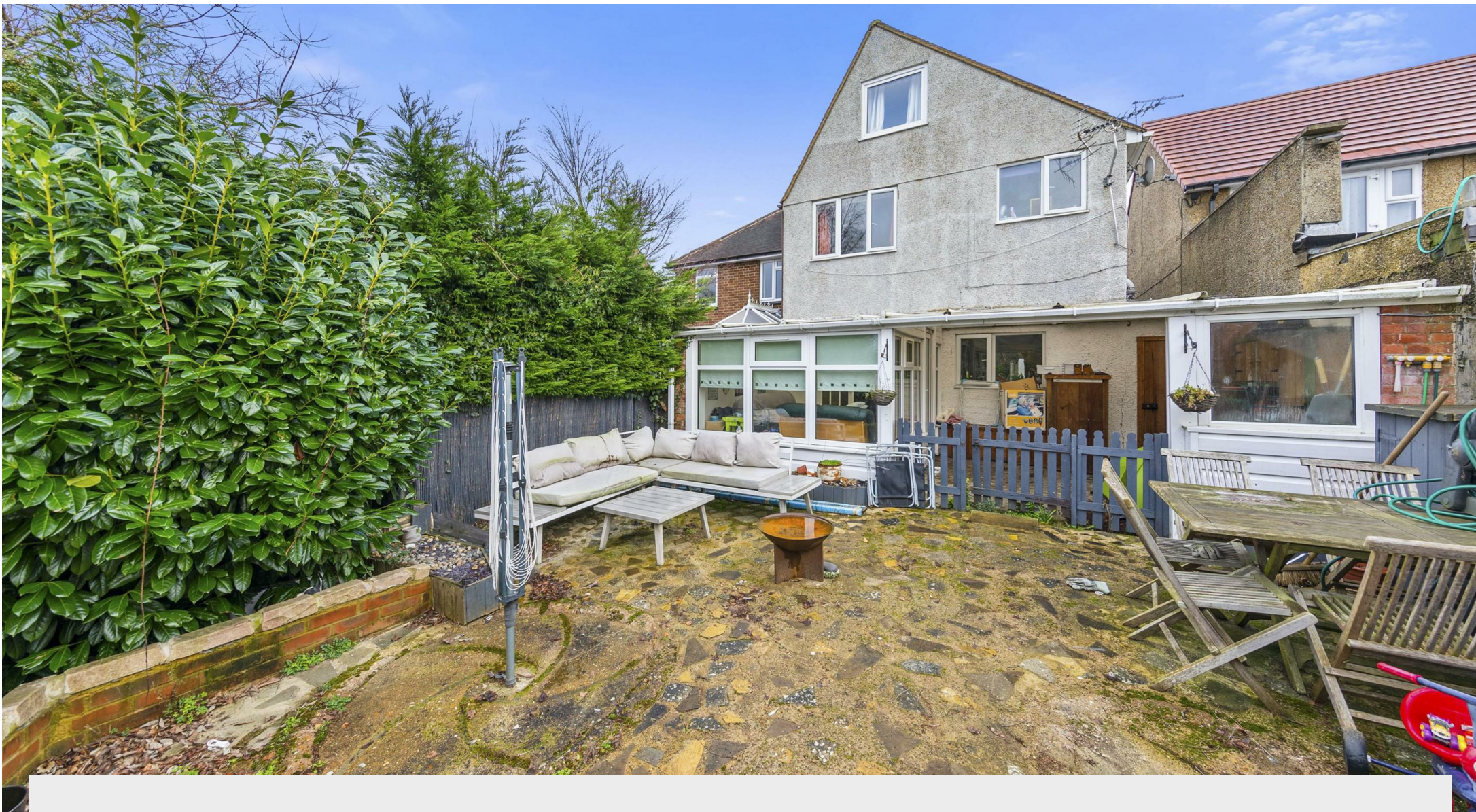
Large Rear Garden