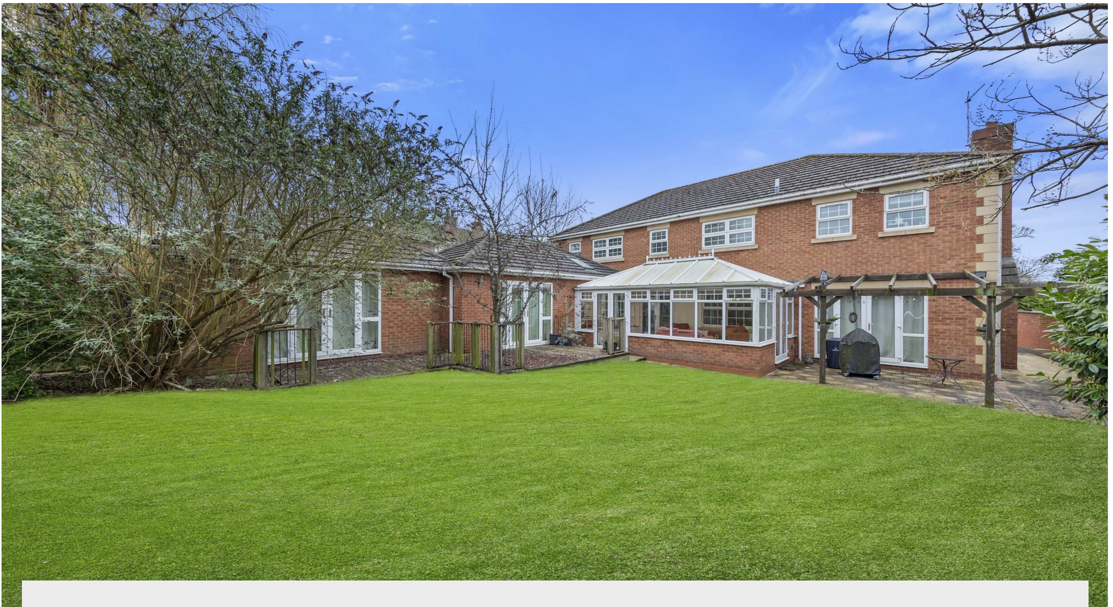
Enclosed Rear Garden.