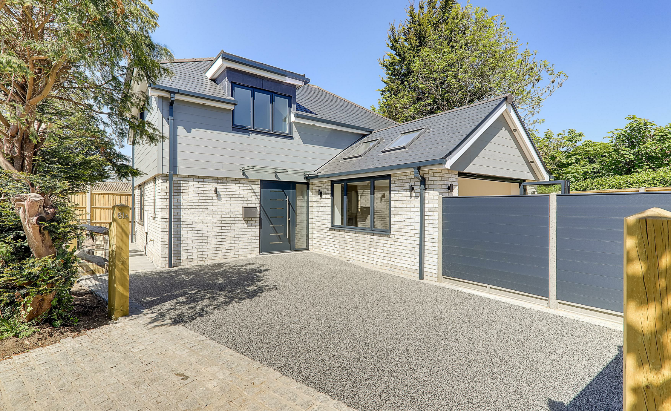
61a Sea Lane Gardens, Worthing, BN12 5ED Guide Price £795,000