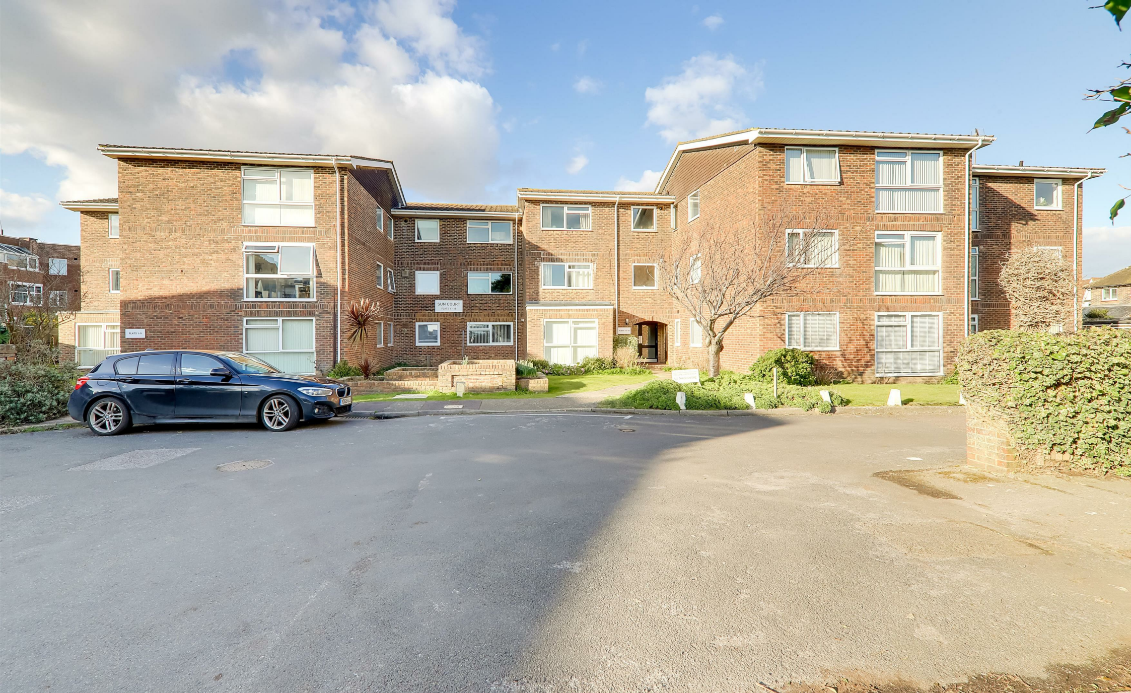
Suncourt Rye Close, Worthing, BN11 5EG Asking Price £230,000