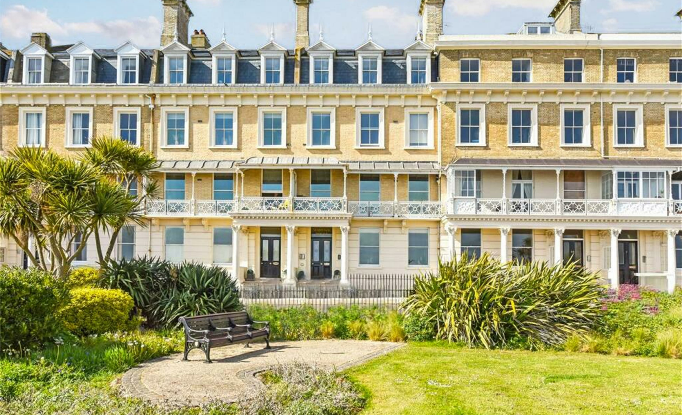
4 Mayfair House, Heene Terrace, Worthing, BN11 3NR Guide Price £495,000