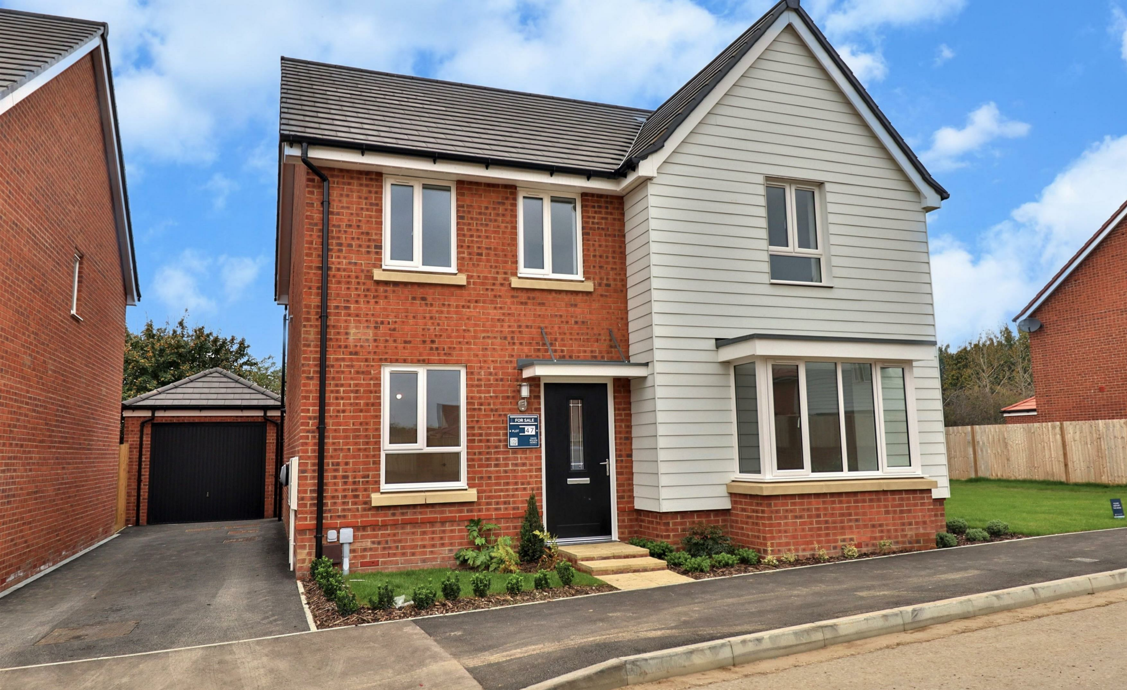
Plot 47 Ecclesden Park, Angmering, BN16 4ED Guide Price £699,995