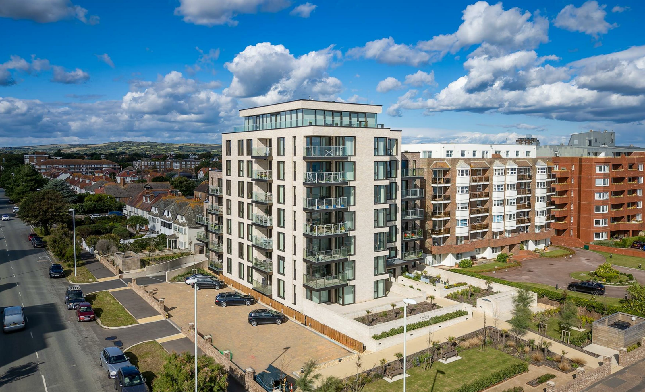
Apartment 17, Calista, 26 West Parade, Worthing, BN11 3FR Asking Price £825,000