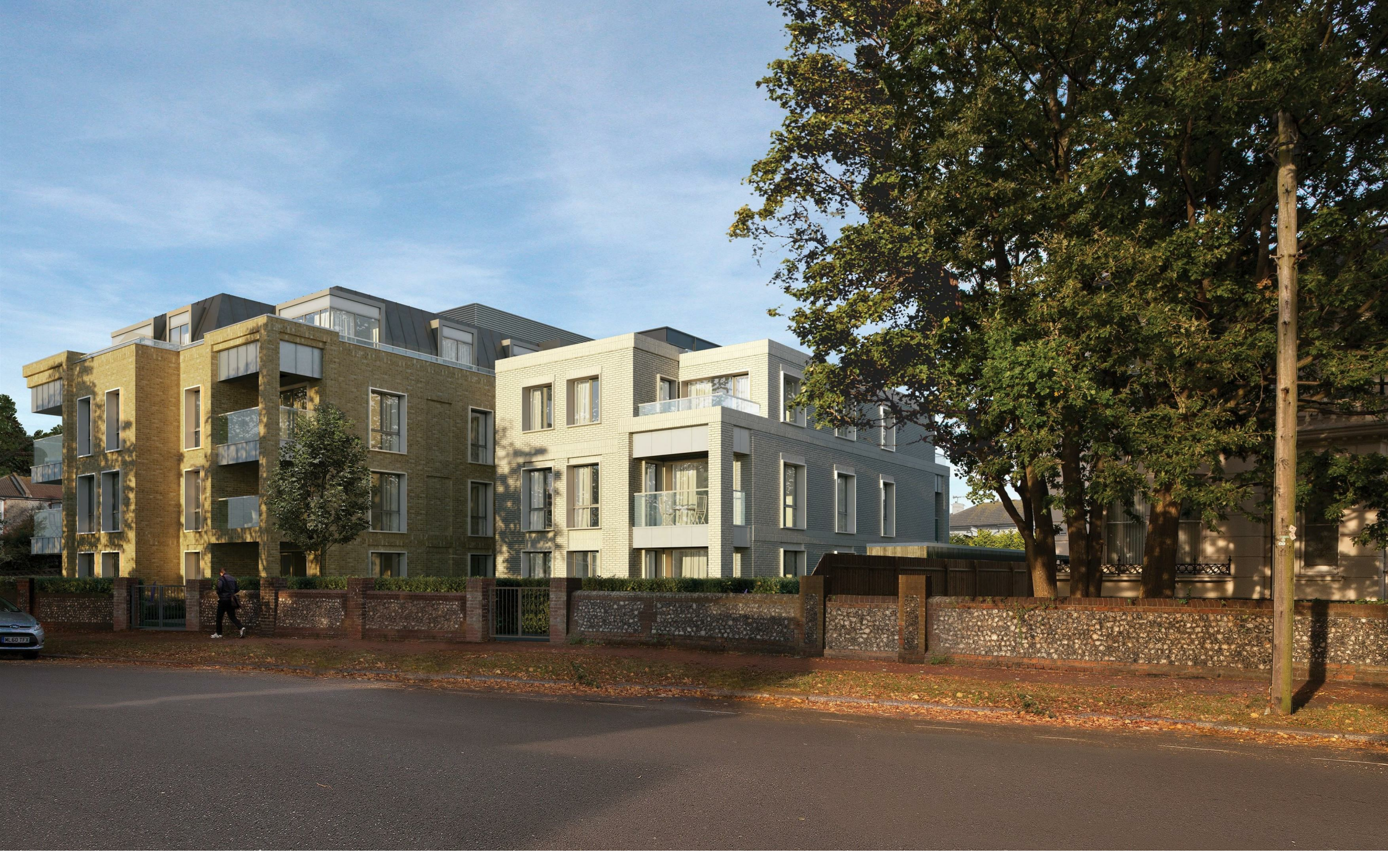
7 Lindfield Place, Worthing, BN11 2FQ £425,000