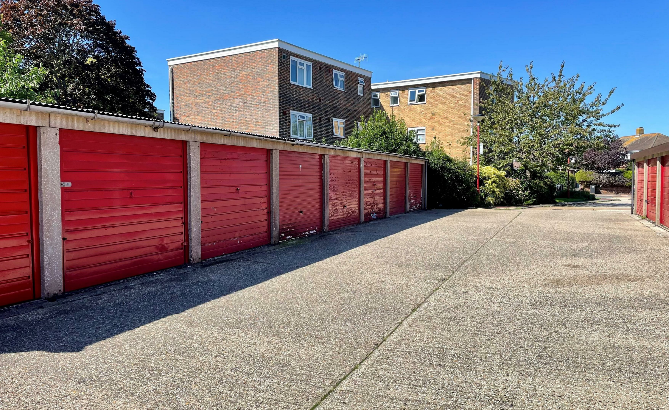
Garage, 23 Sunningdale Court, Jupps Lane, Worthing, BN12 4TU Price £14,000