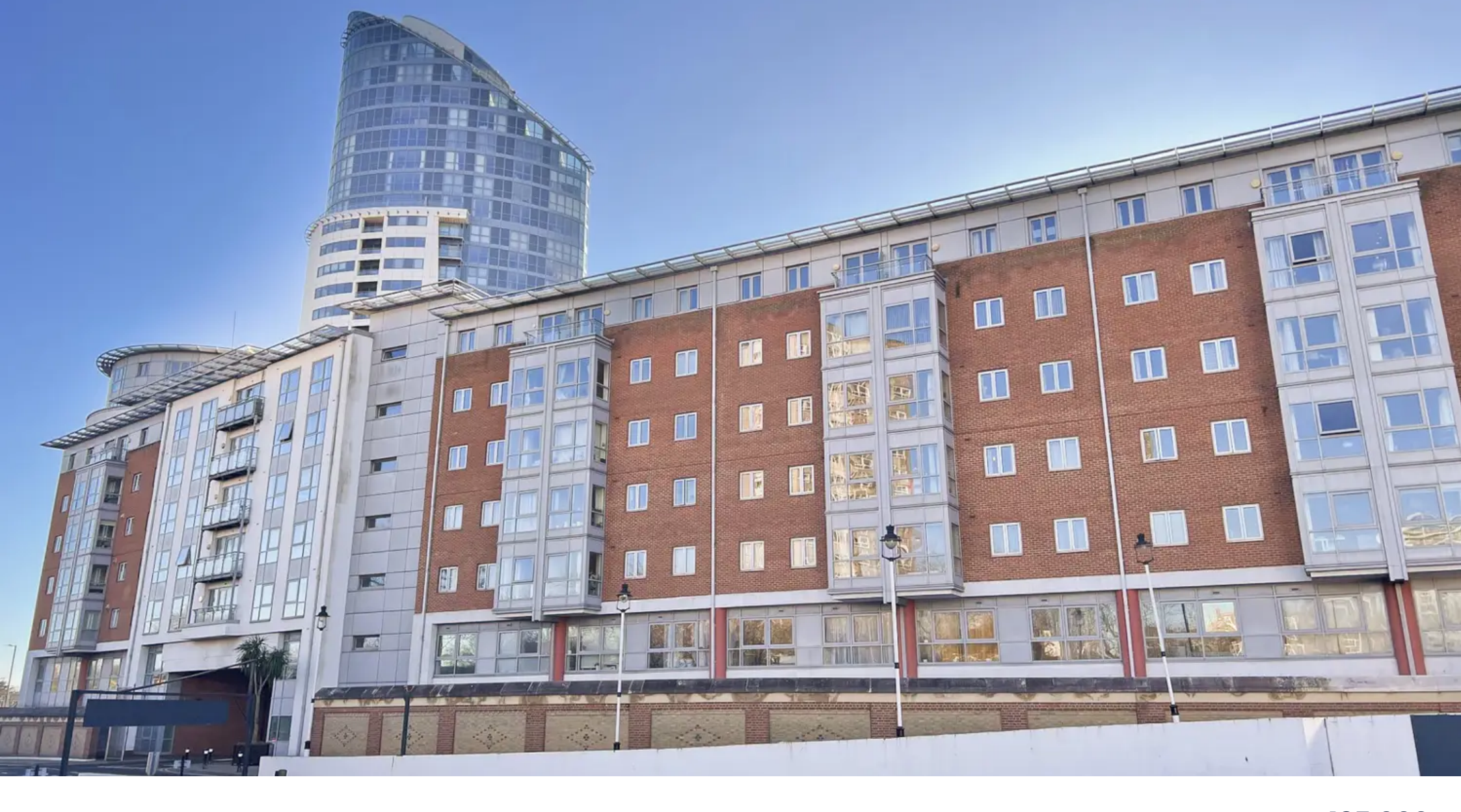
Flat 137, The Round House Gunwharf Quays, Portsmouth