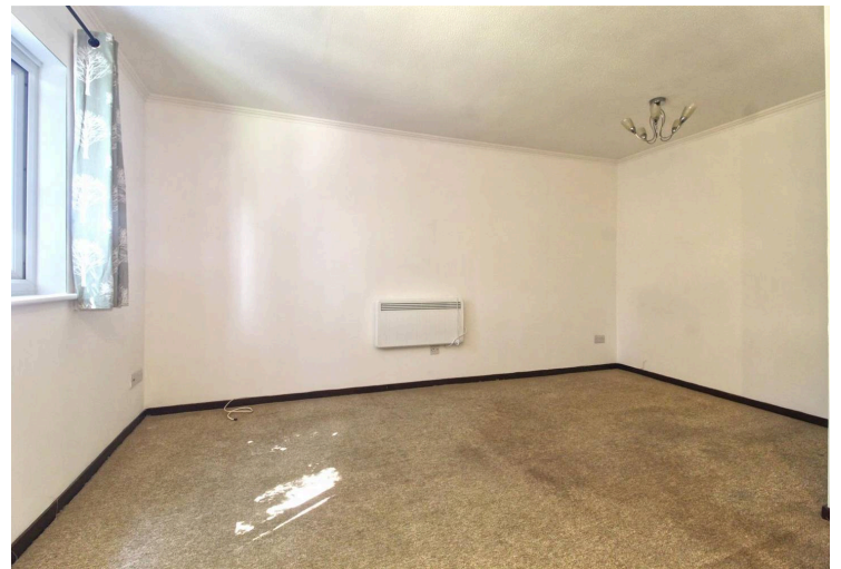
15 Church Row, Ware £185,000 Leasehold