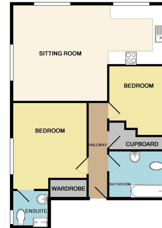
TOTAL APPROX. FLOOR AREA 691 SQ.FT. (64.2 SQ.M.) Whilst every attempt has been made to ensure the accuracy of the floor plan contained here, measurements of doors, windows, rooms and any other items are approximate and no responsibility is taken for any error, omission, or mis-statement. This plan is for illustrative purposes only and should be used as such by any prospective purchaser. The services, systems and appliances shown have not been tested and no guarantee as to their operability or efficiency can be given. Made with Metropix 62017