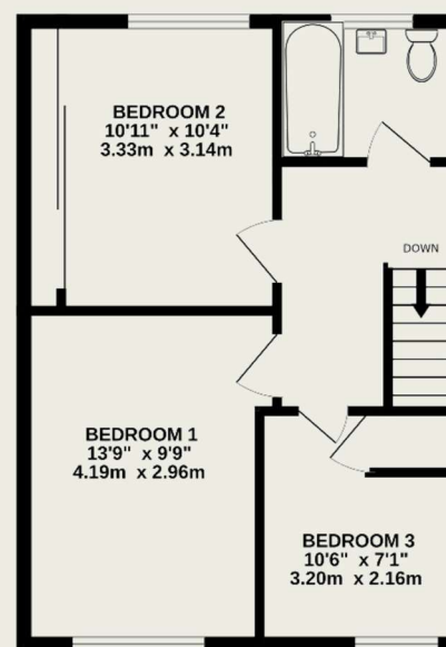
1ST FLOOR 427 sq.ft. (39.7 sq.m.) approx.

TOTAL FLOOR AREA : 959 sq.ft. (89.1 sq.m.) approx.