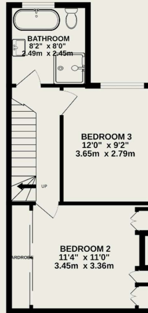
1ST FLOOR 413 sq.ft. (38.4 sq.m.) approx.