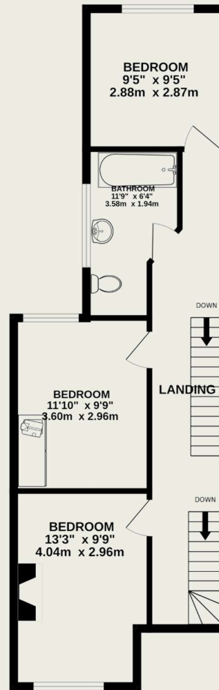
1ST FLOOR 535 sq.ft. (49.7 sq.m.) approx.