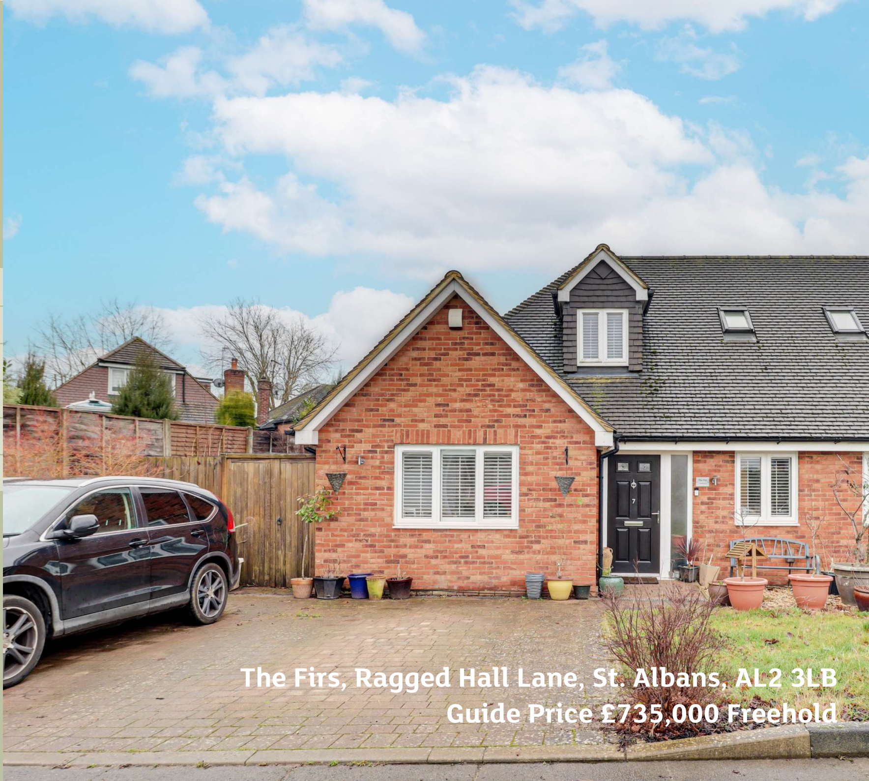
The Firs, Ragged Hall Lane, St. Albans, AL2 3LB Guide Price £735,000 Freehold