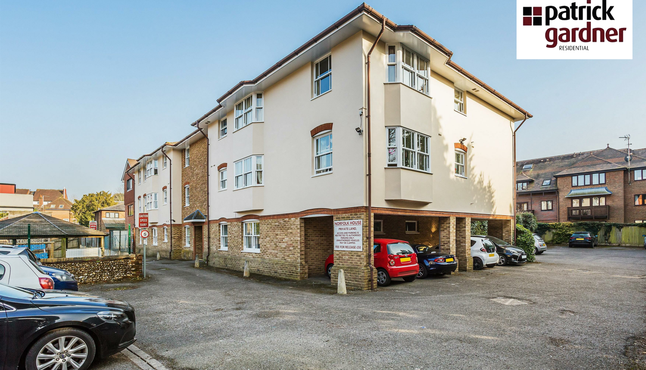
2 Norfolk Mews South Street, Dorking, RH4 2EX