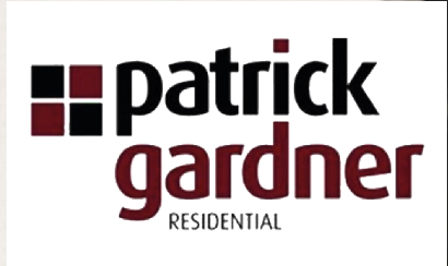
2 Green Yard Vincent Walk, Dorking, Surrey, RH4 2FZ