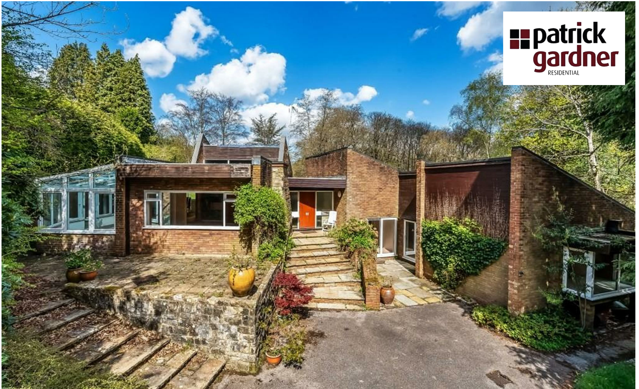
The Master Builders Broome Hall Road, Coldharbour, Dorking, RH5 6HP