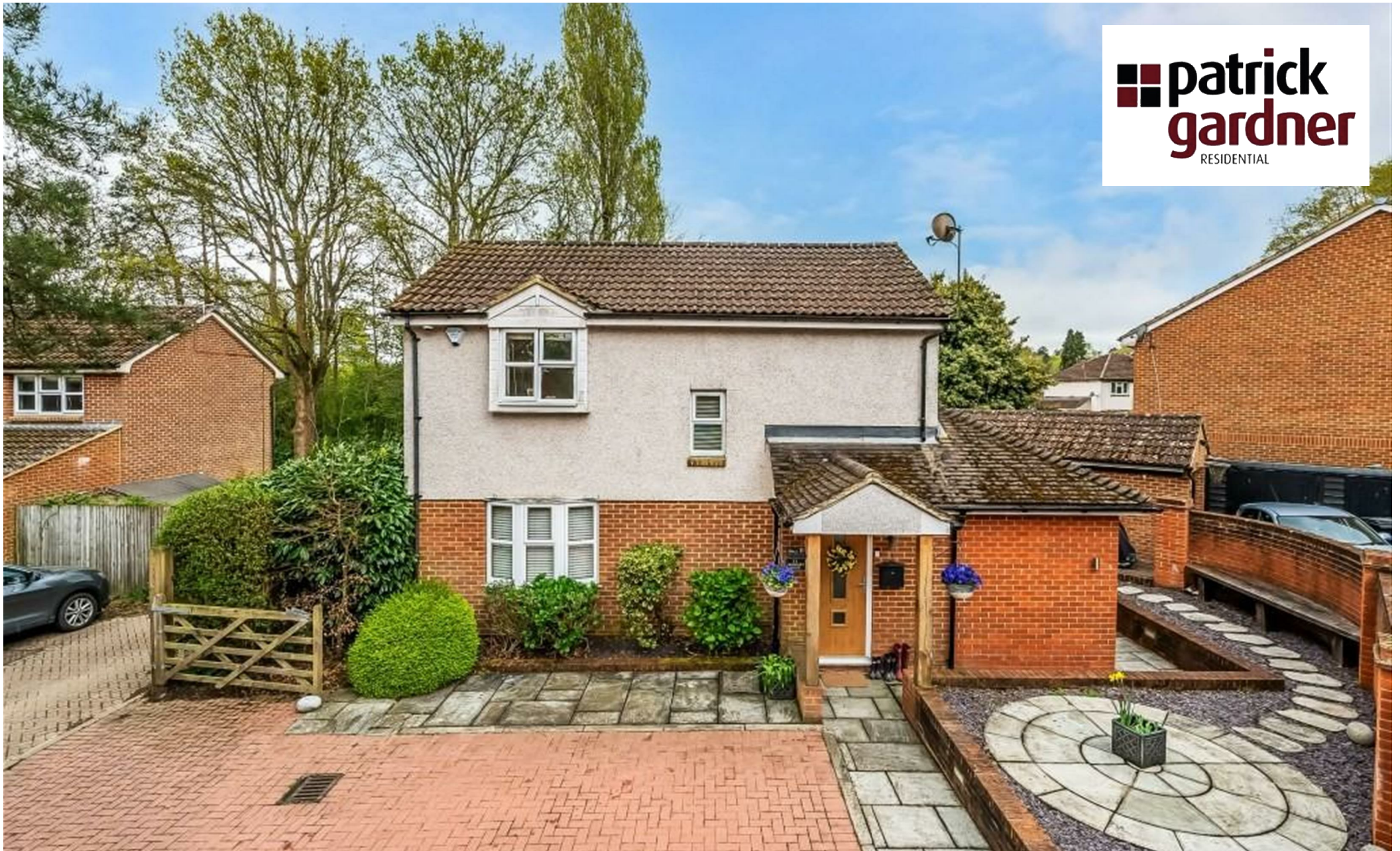
11 Bakers Way, Capel, Dorking, RH5 5JS