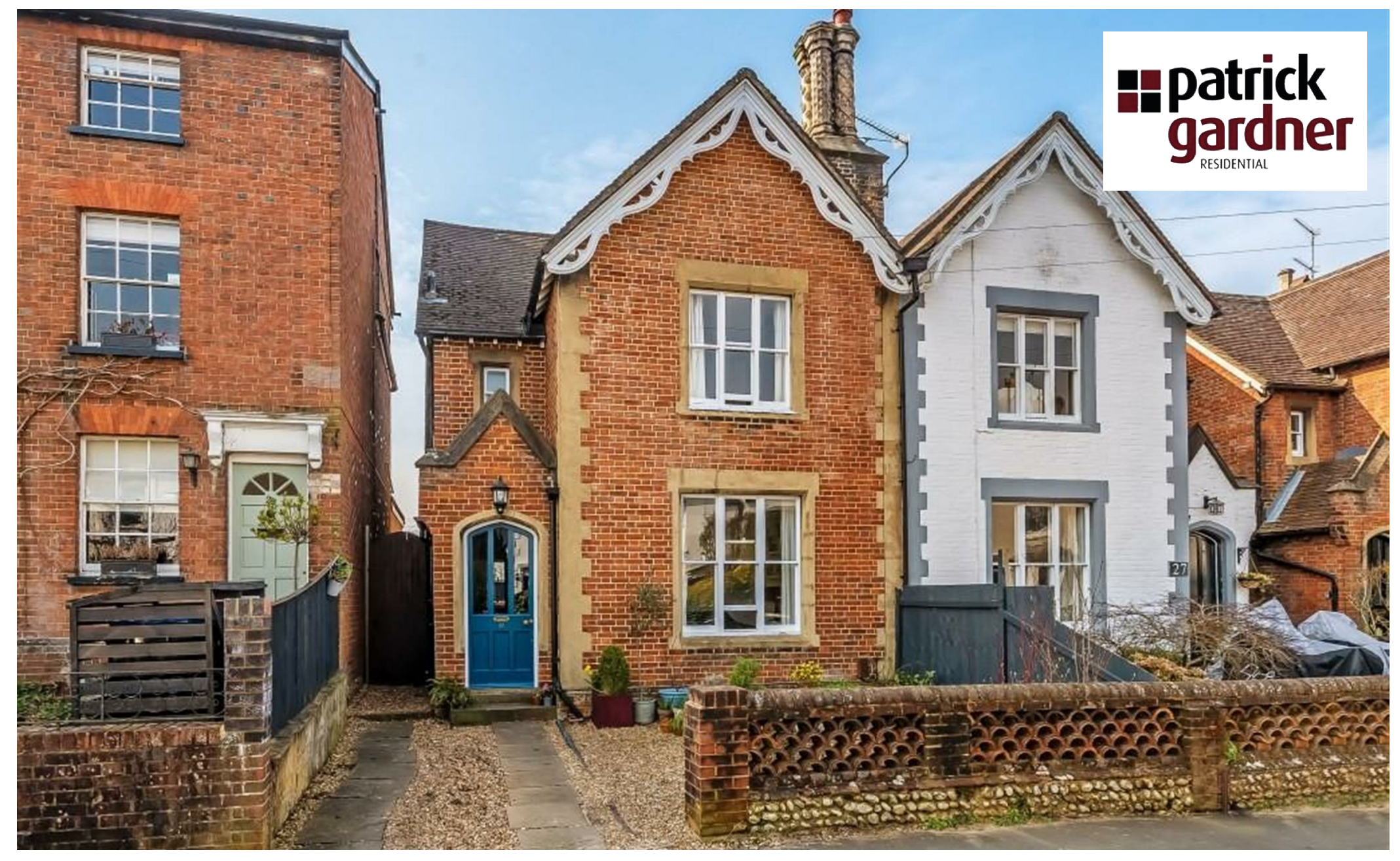
26 Howard Road, Dorking, Surrey, RH4 3HP