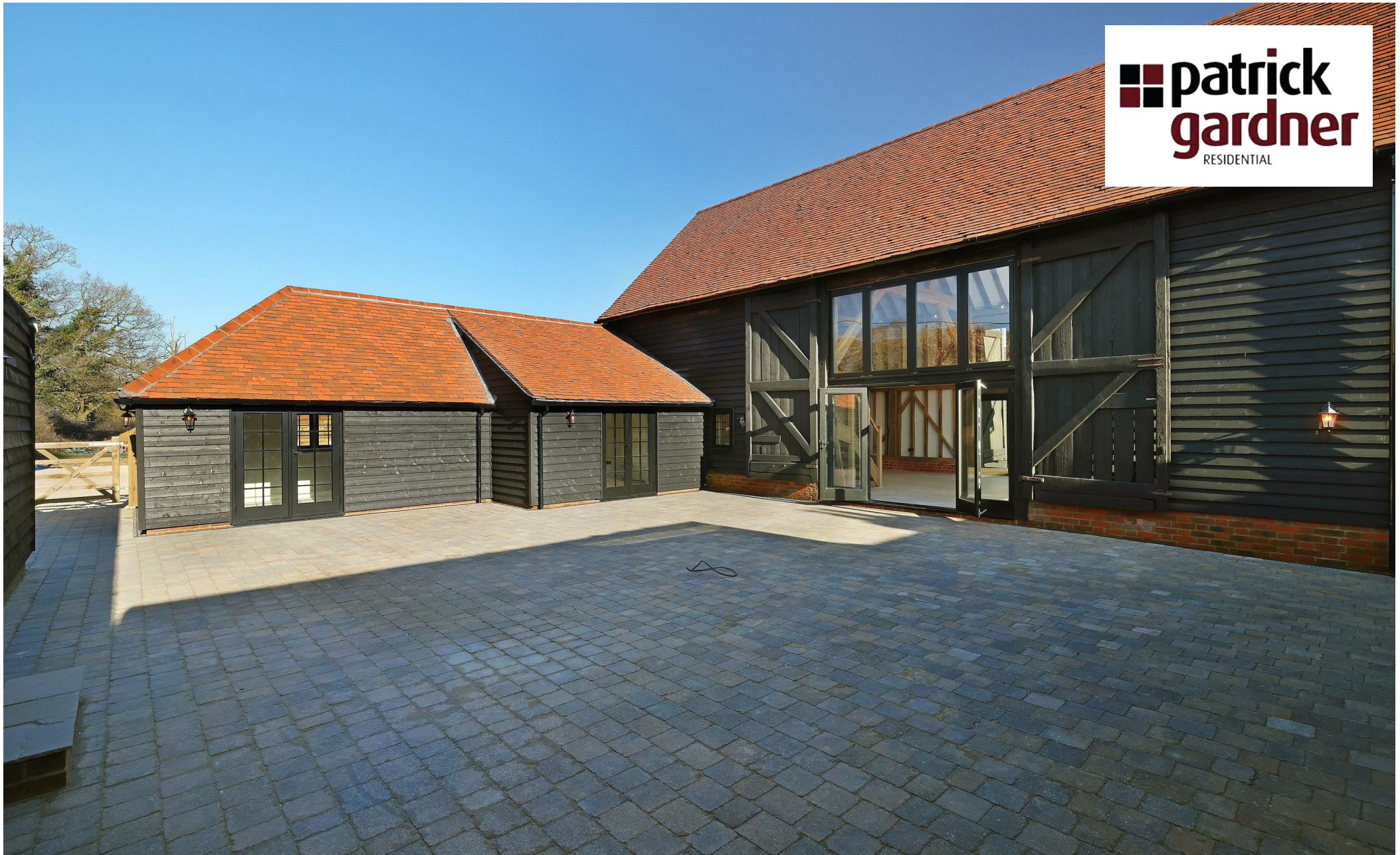
Williams Barn, 15a Reigate Road, Sidlow, Reigate, RH2 8QH