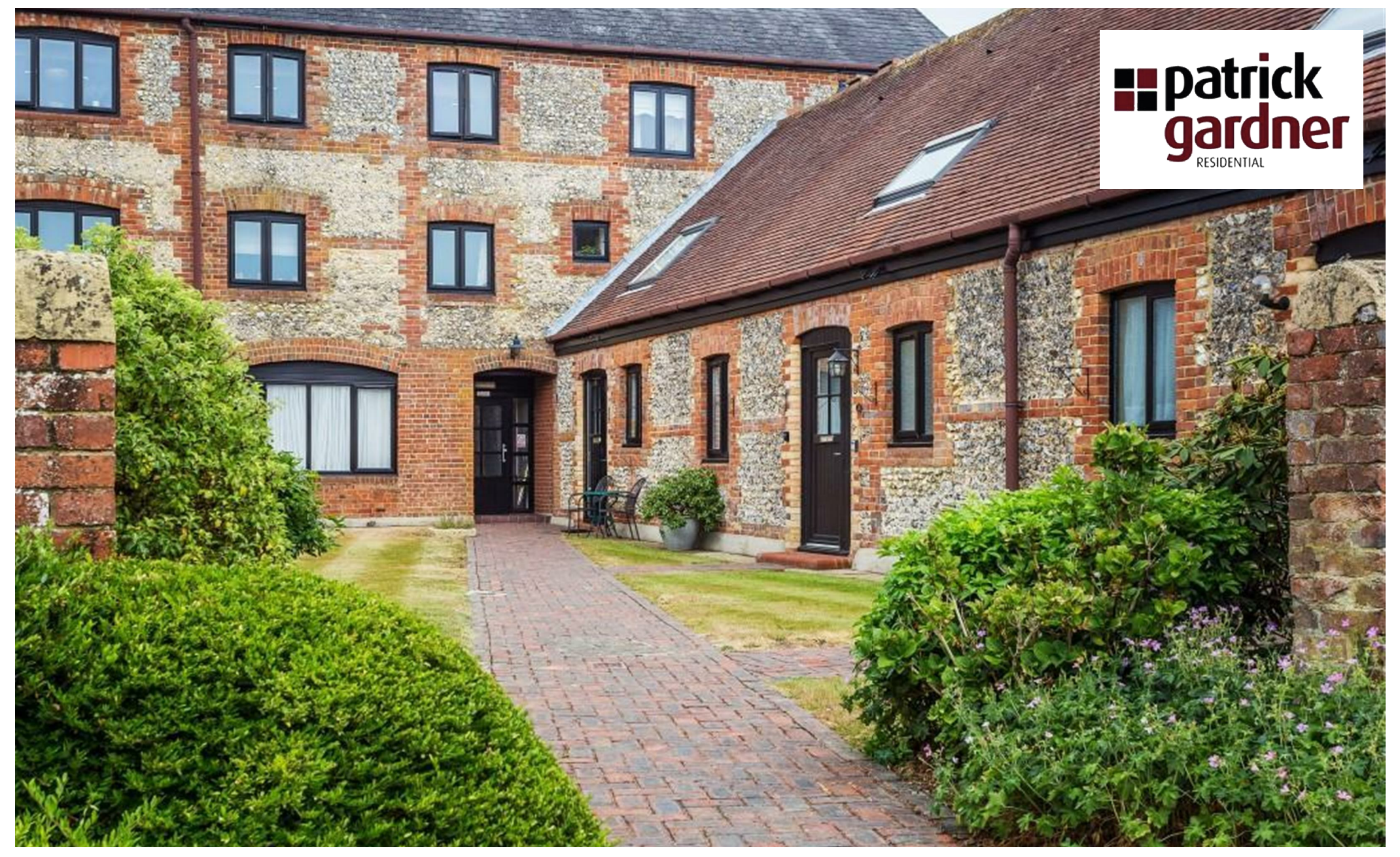
6 Sondes Farm Glebe Road, Dorking, Surrey, RH4 3EF