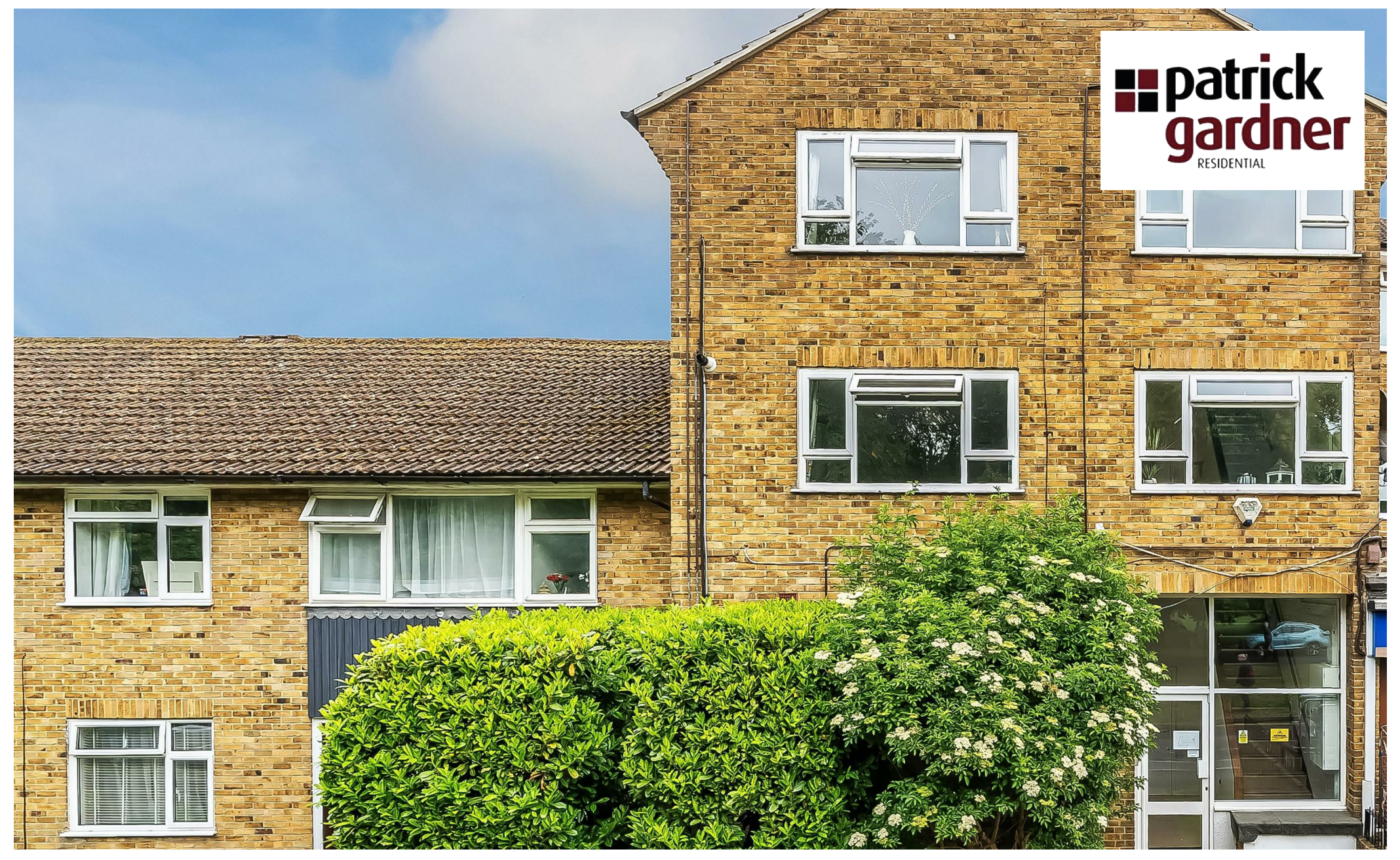
10a, Woodlodge Woodfield Lane, Ashtead, KT21 2DJ