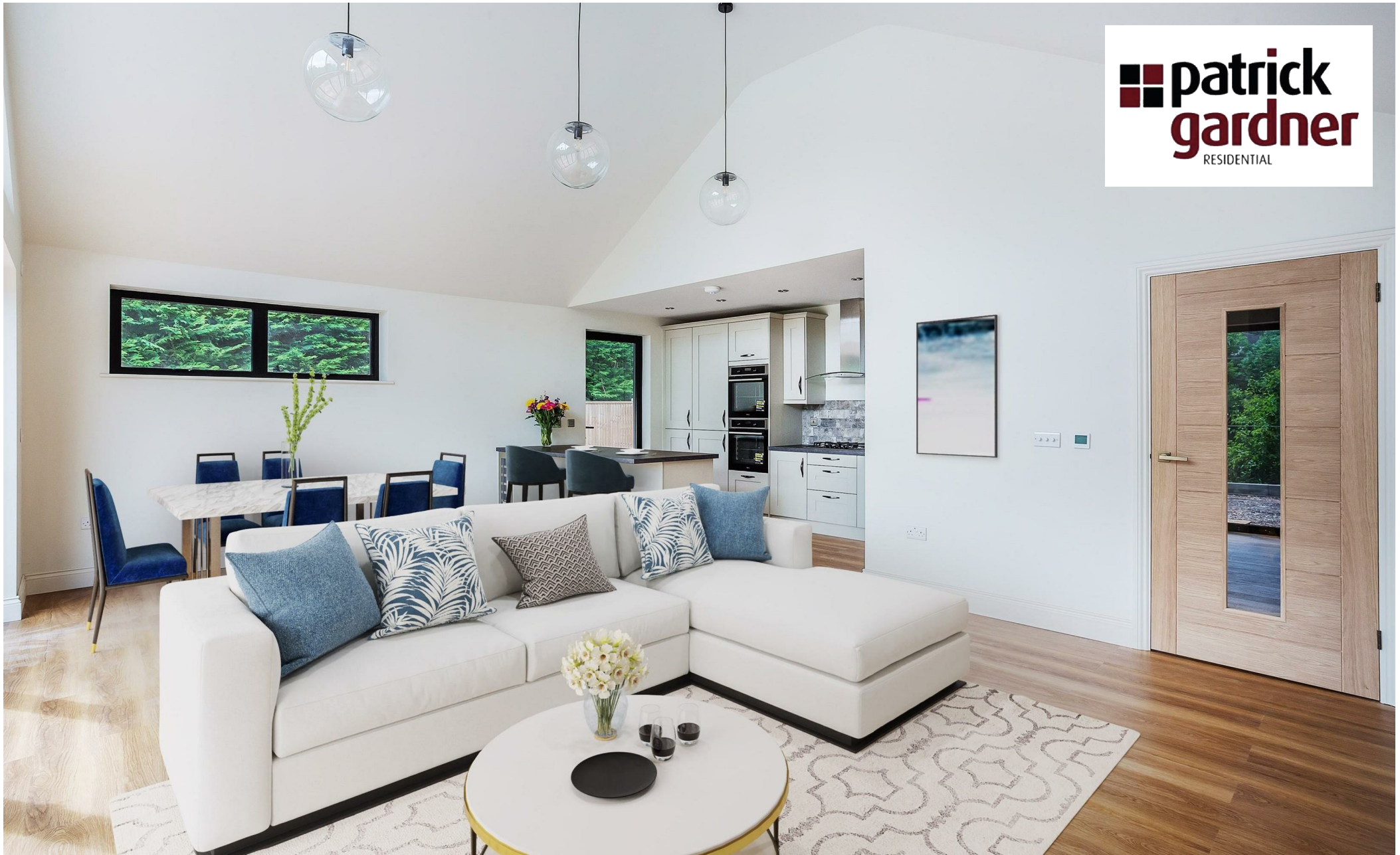
Floral Cottage The Chase, Ashted, Surrey, KT21 2JN