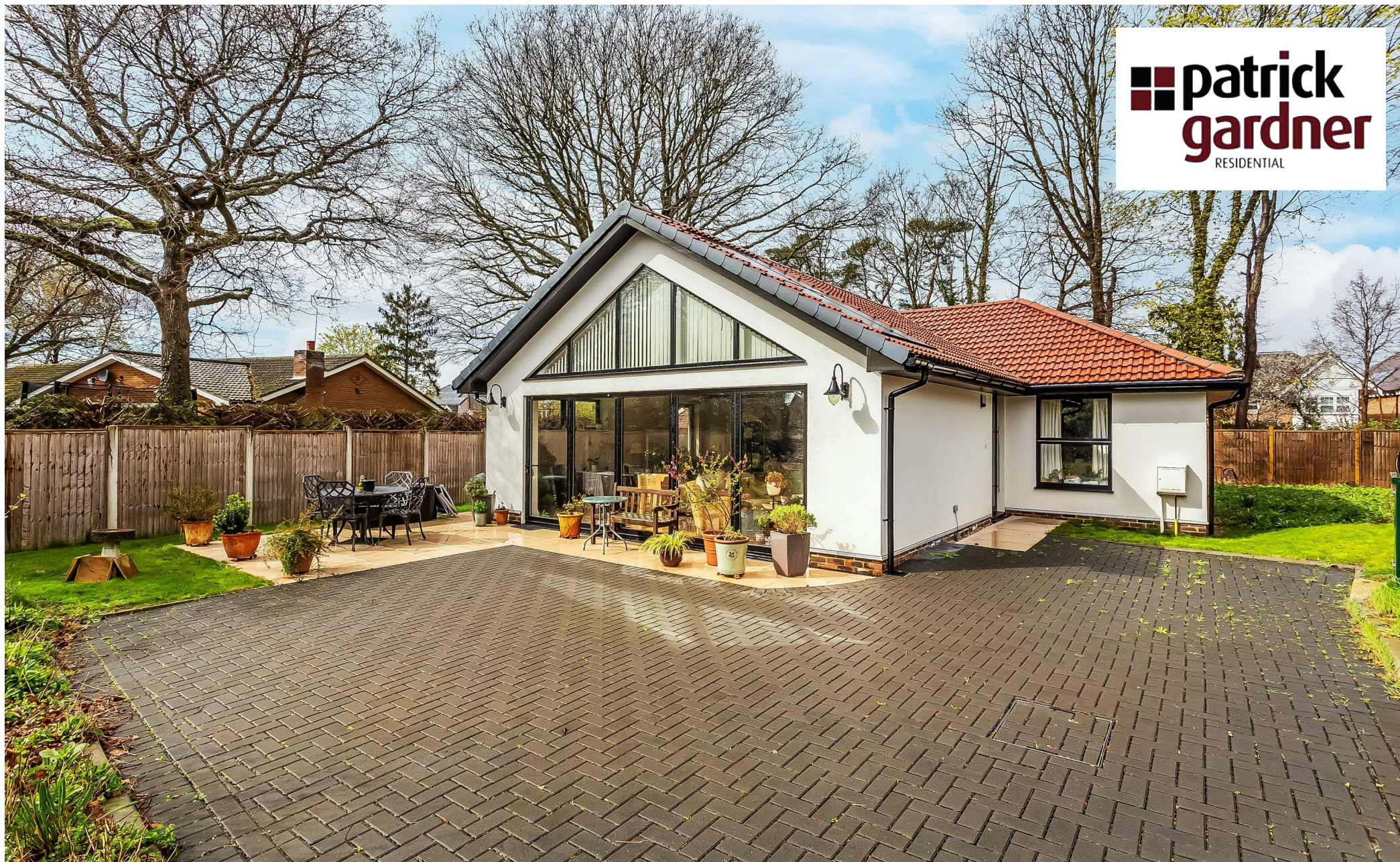
Floral Cottage The Chase, Ashted, Surrey, KT21 2JN