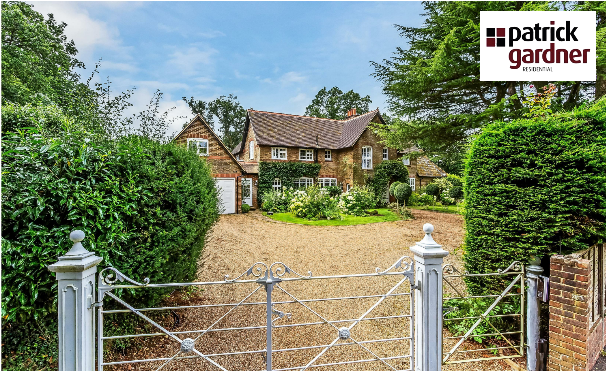
Keepers Cottage Ebbisham Lane, Walton On The Hill, Tadworth, KT20 5BT