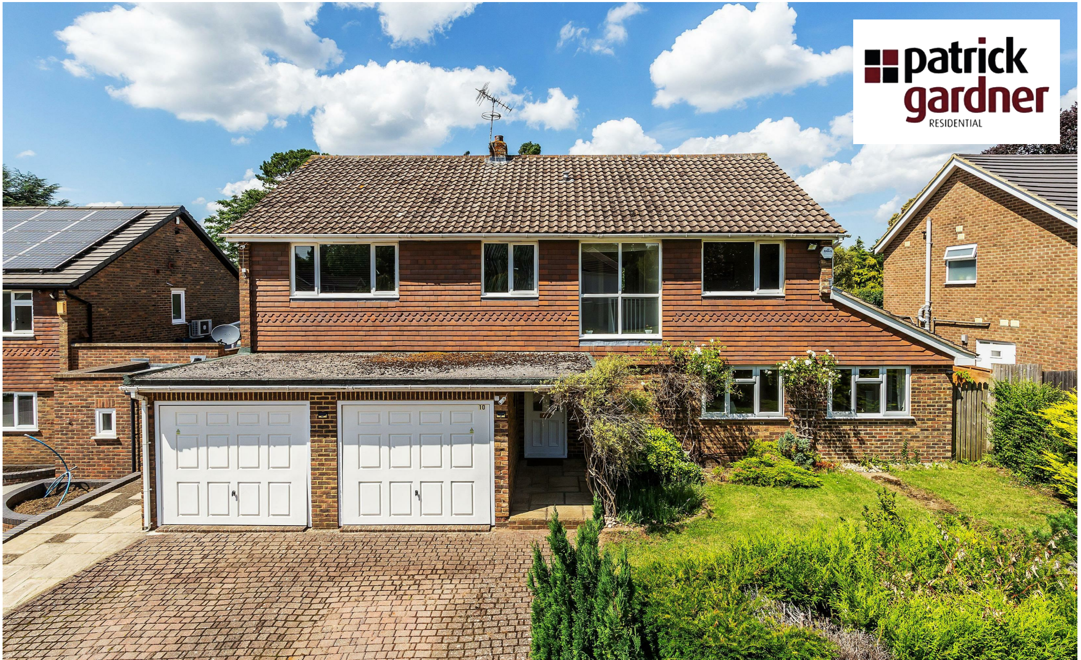
10 Beechcroft, Ashted, Surrey, KT21 2TY