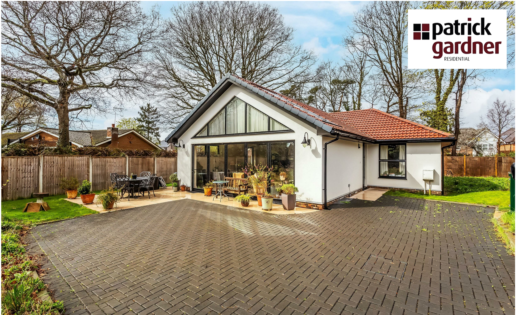
Floral Cottage The Chase, Ashted, Surrey, KT21 2JN