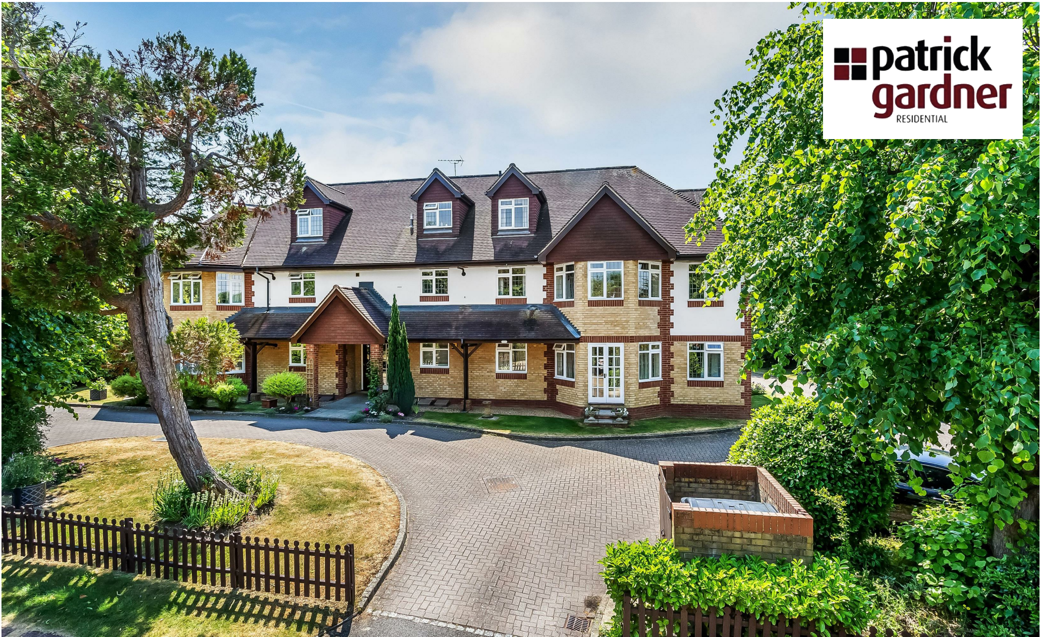
4 Berkeley Lodge 2 Highfields, Ashted, KT21 2NL