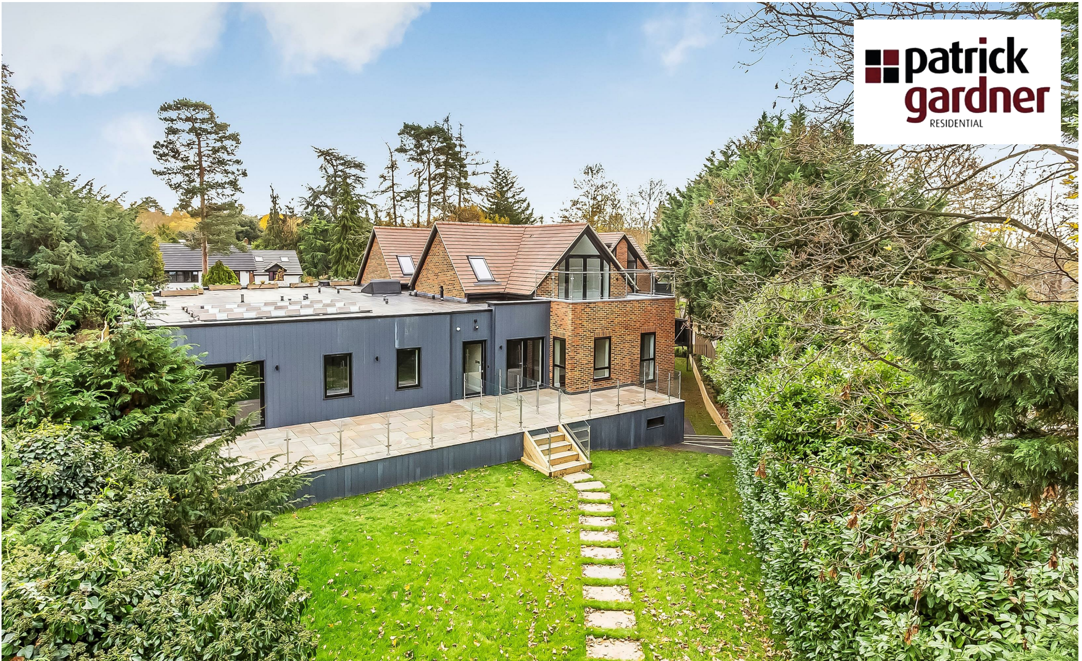
Plot 6 One Parkers Hill, Ashted, Surrey, KT21 2AR