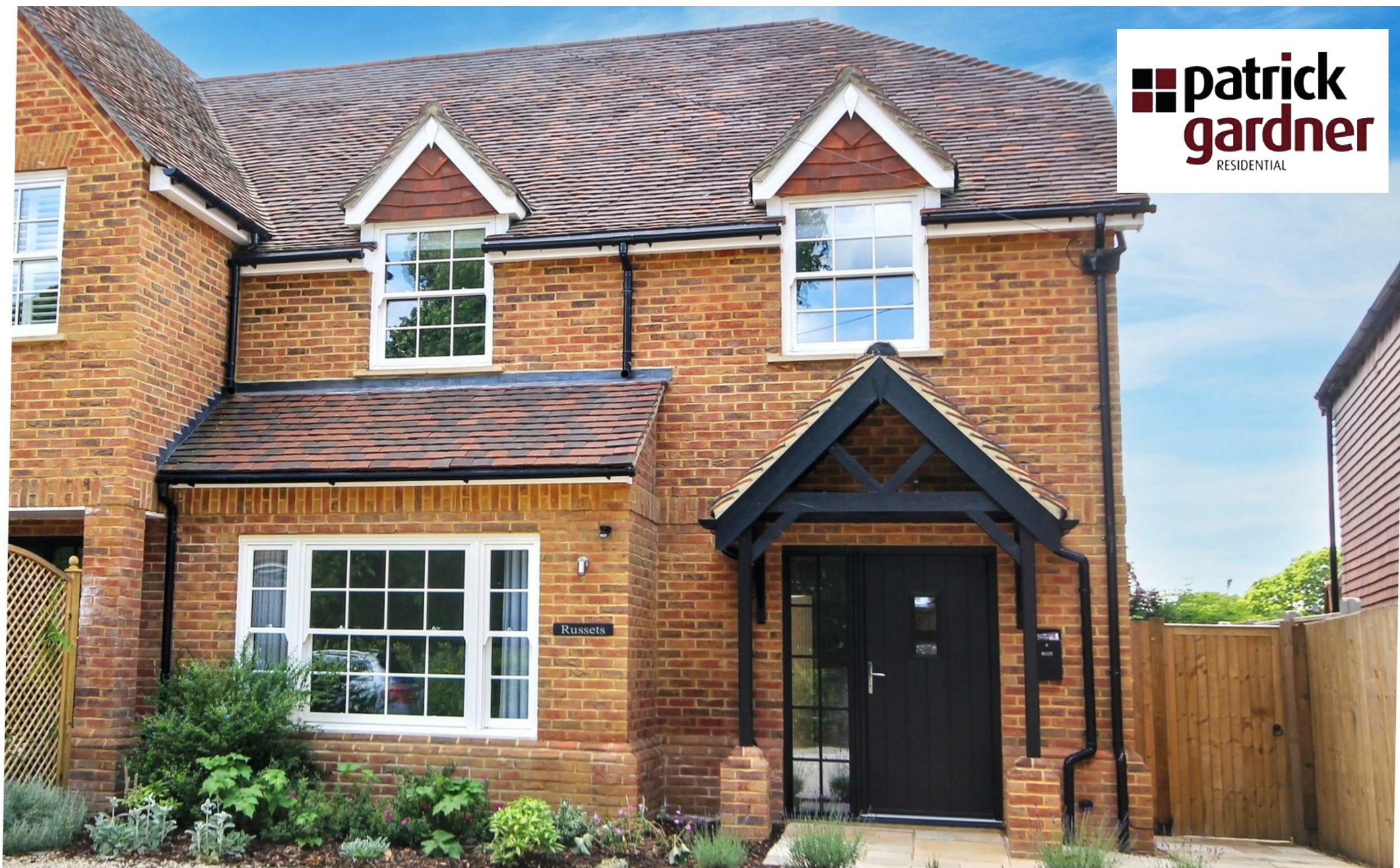
Russets The Street, Effingham, Surrey, KT24 5LQ